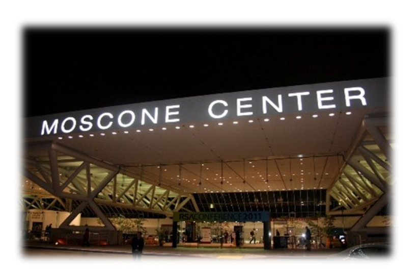
Moscone Convention Center