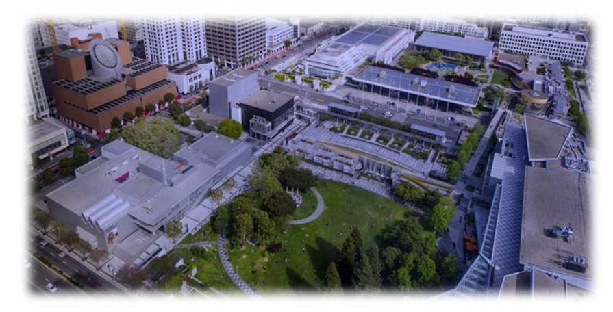
Yerba Buena Gardens