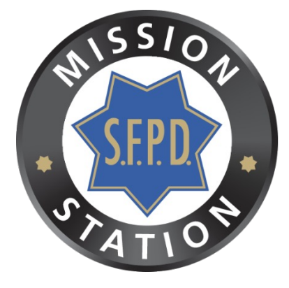
BOARD OF SUPERVISORS