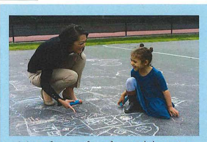
Join us for one of our free workshops at a local public library near you!

Property Tax Savings is a free educational workshop for families and senior homeowners. The workshop will cover how your property taxes are calculated and share tax savings that you may be eligible for as a homeowner in California.