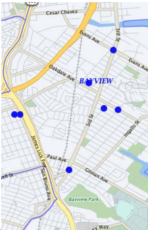
Robberies - 8

Crime maps for the week of 08/05/2019 to 08/11/2019