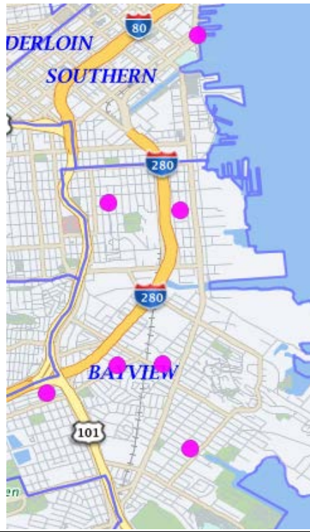
Burglaries - 7