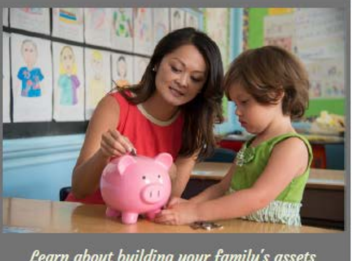
Learn about building your family's assets and estate planning for the future

Register today: sfassessor.org/familywealthforum