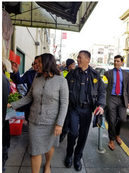
Chinatown Merchants Walk with Mayor London Breed 2/4/19