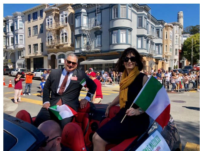
150th Italian Heritage Day Parade 10/7/18