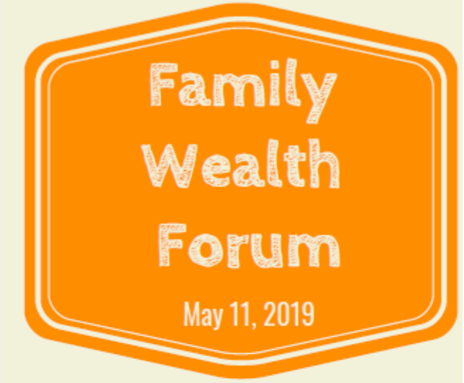
Register today: sfassessor.org/familywealthforum