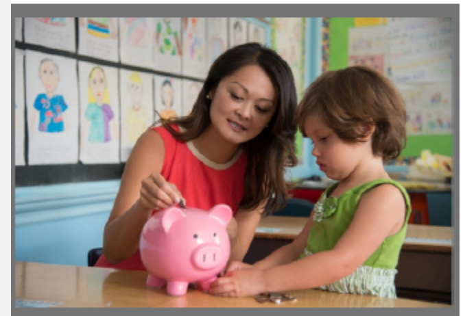
Learn about building your family's assets and estate planning for the future