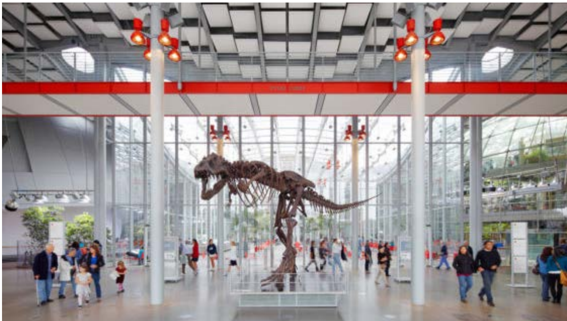
California Academy of Sciences