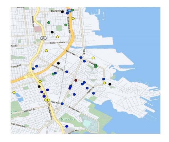
Color Key: Robbery Burglary Auto Boost Auto Theft Homicide Aggravated Assault