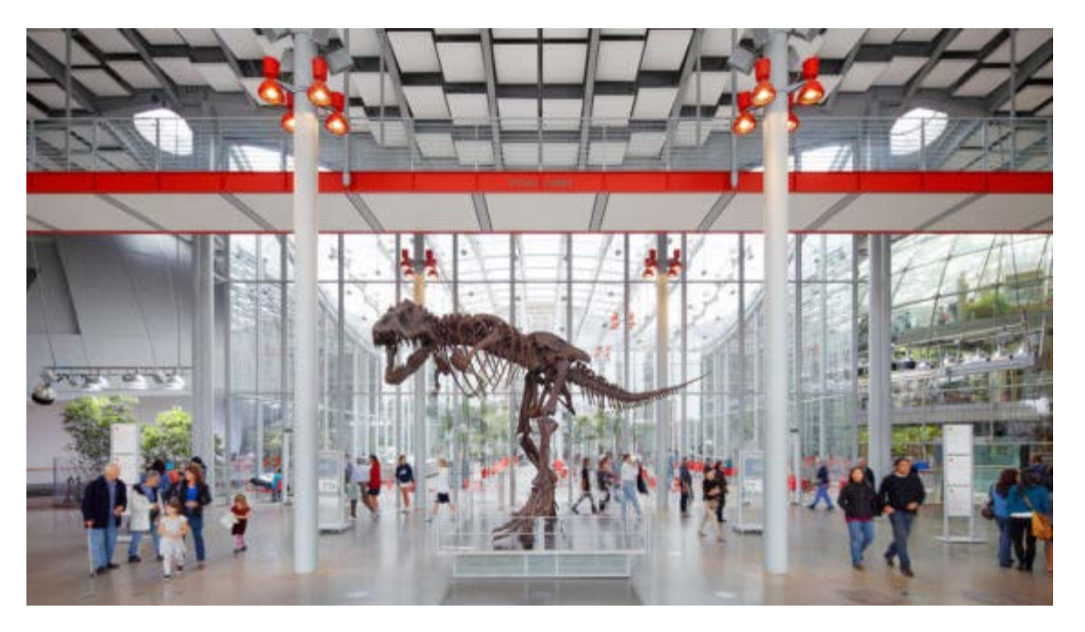
California Academy of Sciences