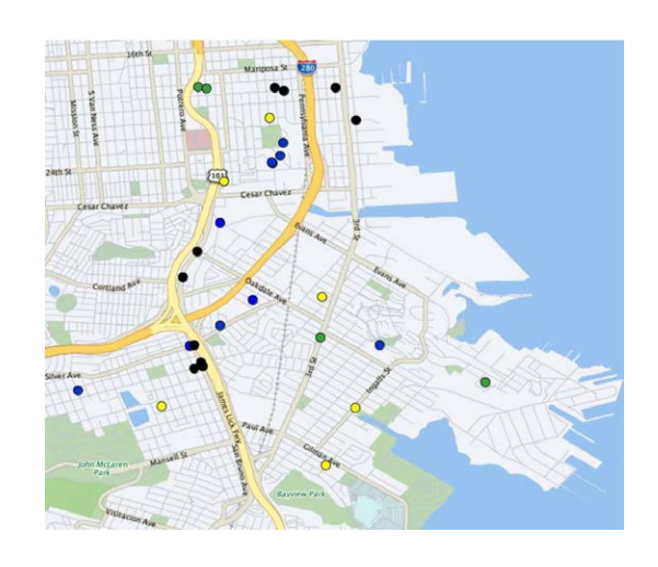
Robbery Burglary Auto Boost Auto Theft Homicide Aggravated Assault