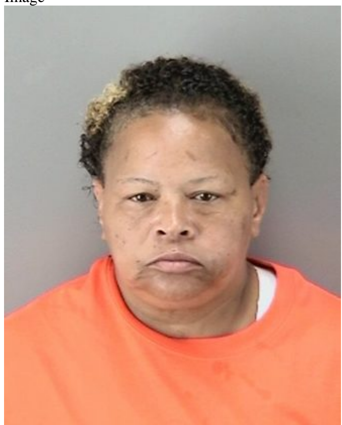
October 24, 2018 | 9:24 AM Share: